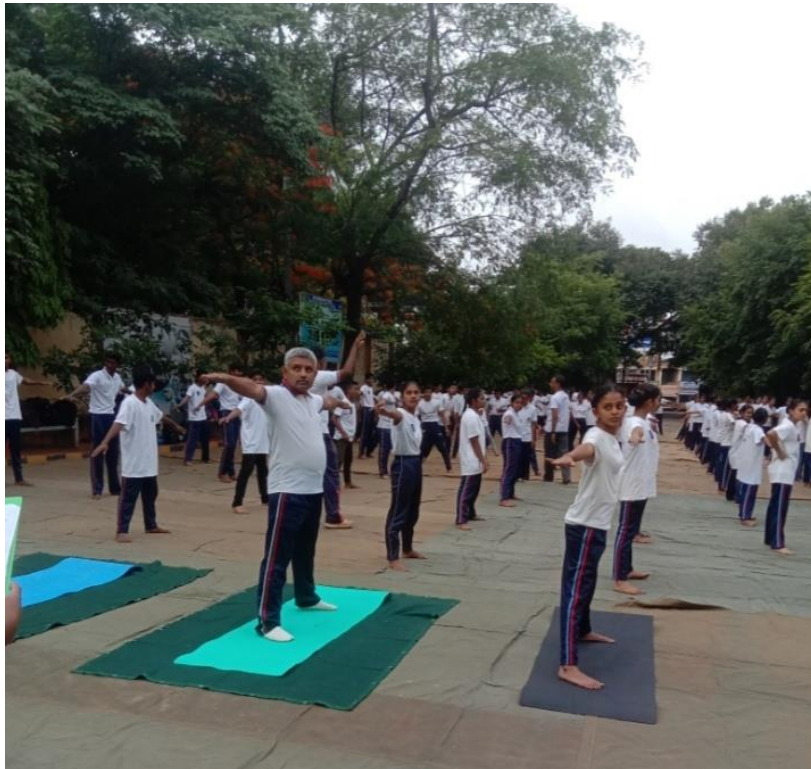
Sri Siddhartha Medical College, Tumkur