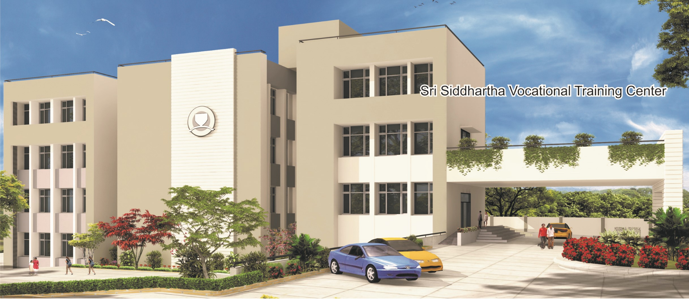
Sri Siddhartha Vocational Training Center