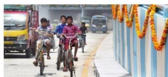
Magadi Road underpass was thrown open to the public after it was inaugurated by Chief Minister Siddaramaiah, in Bengaluru on Saturday.